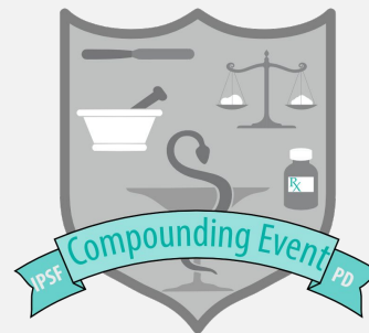
CE Compounding Event